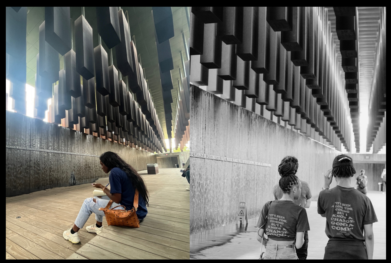
Pictured: VBC students at Lynching Memorial in Montgomery, AL