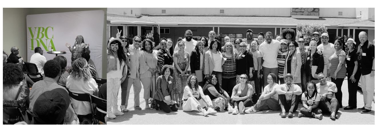
Pictured: Attendees at the First VBC DNA Class