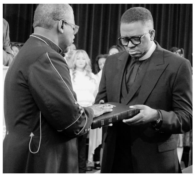
Love You All Dearly,

"For therein is the righteousness of God revealed from faith to faith: as it is written. The just shall live by faith." (Rom. 1:17)